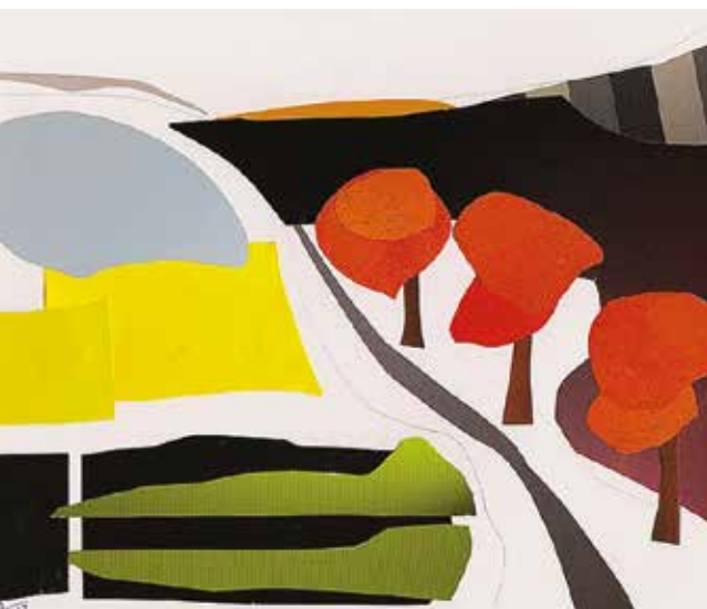
DEBORAH ANN, LANDSCAPE WITH 3 TREES

Send your creative efforts to this open competition before 2 July. All shortlisted artworks go on show at Bishop's Palace and Gardens in Somerset from 8 to 22 October. wac.artopps.co.uk